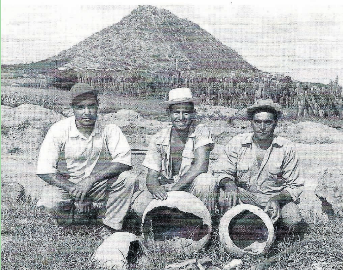
Excavated ancient Indian pottery in the Hooiberg area.

If you are interested in connecting and really know all about your travel destination—our flora, fauna, geology, history, autochthonous art, as well as the true identity of the island—you should book a visit to Etnia Nativa, a unique native gem! Let Anthony, our acclaimed cultural columnist, guide and lecture you regarding the most interesting and revealing stories about Aruba's undiscovered native ethnicity, an adventure beyond beaches and tourist traps. Visit his magnificent dwelling that integrates reused materials with nature, bursting with culture and island heritage! Whats App +297 592 2702 etnianativa03@gmail.com